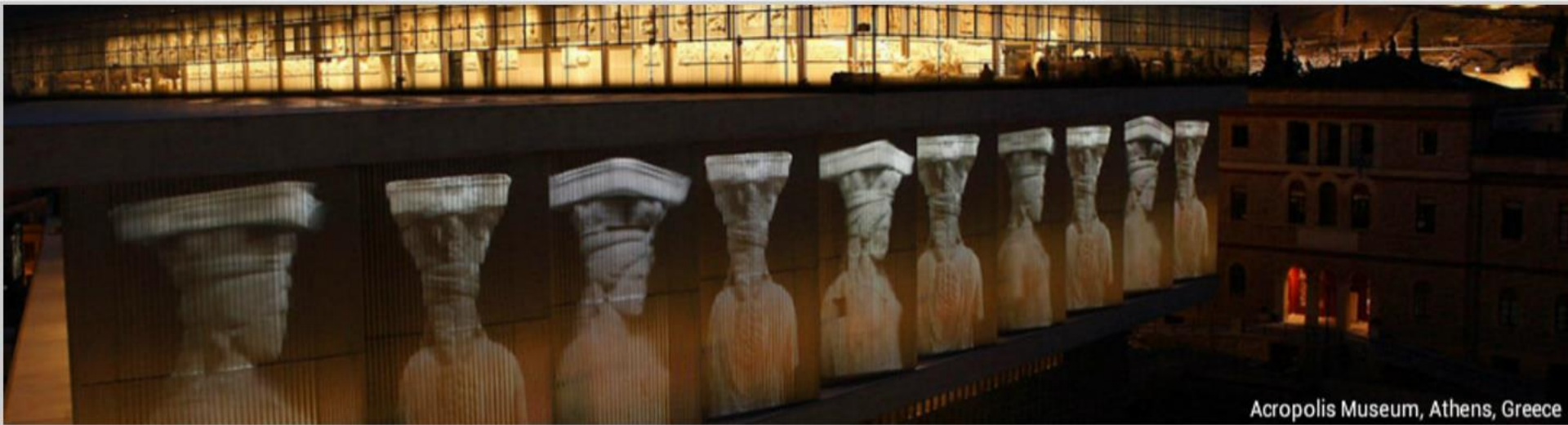
Acropolis Museum, Athens, Greece