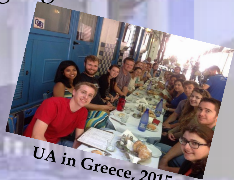
UA in Greece, 2015